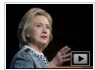
Clinton, hungry for White House, makes second...