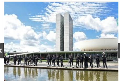
Police stand guard during a protest against the government