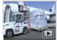
Second ICRC aid plane arrives in Yemen...

Subscribe - Deccan Herald's YouTube channel