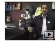
Yemen: A Survivor's account